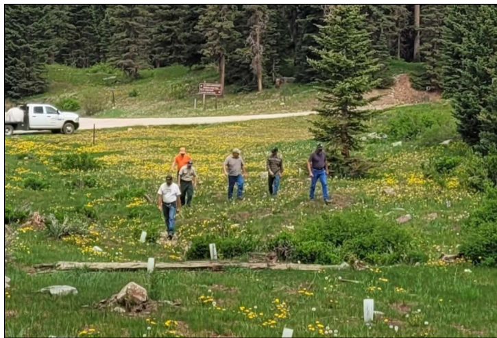
Meeting to discuss bypass re-route at Purgatory