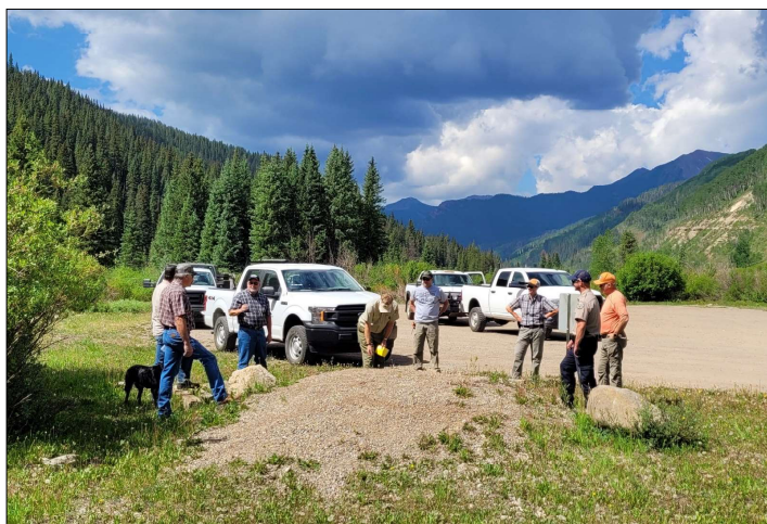
Meeting to discuss Barlow parking expansion